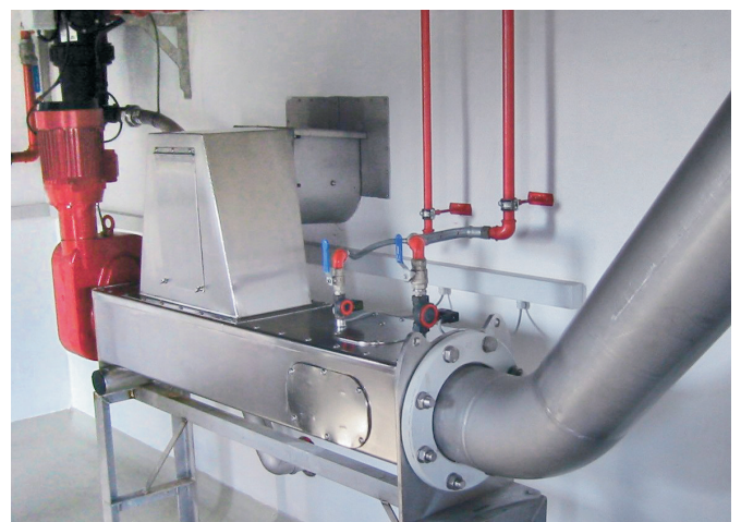
Meva Screw Wash Press - Compact and easy to operate