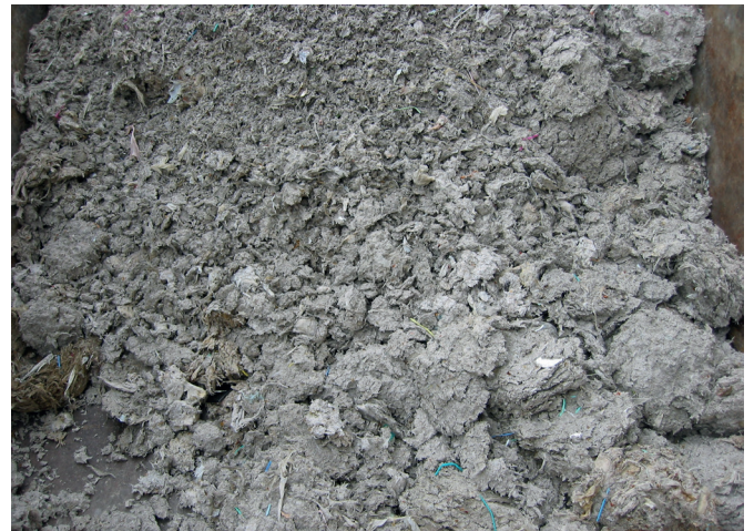
Washed and dewatered screenings