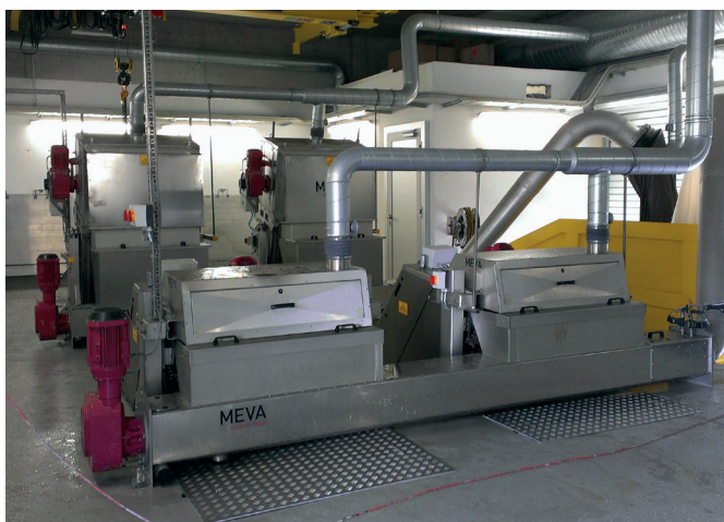
Washing and dewatering